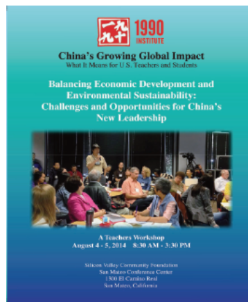
2014: China's Growing Global Impact: Balancing Economic Development and Environmental Sustainability