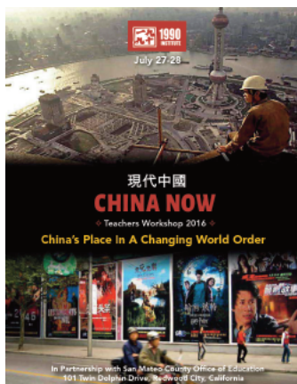
2016: China's Place in a Changing World Order