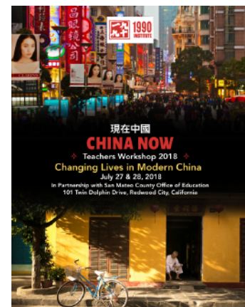
2018: Changing Lives in Modern China