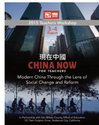
2015: Modern China Through the Lens of Social Change and Reform