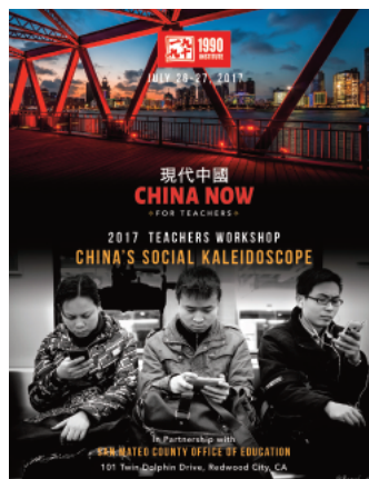
2017: China's Social Kaleidoscope